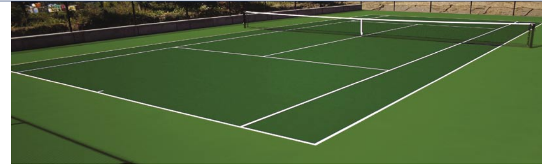
Light Green | Dark Green