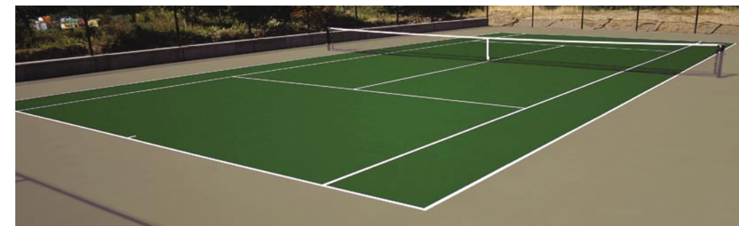
Brick | Dark Green