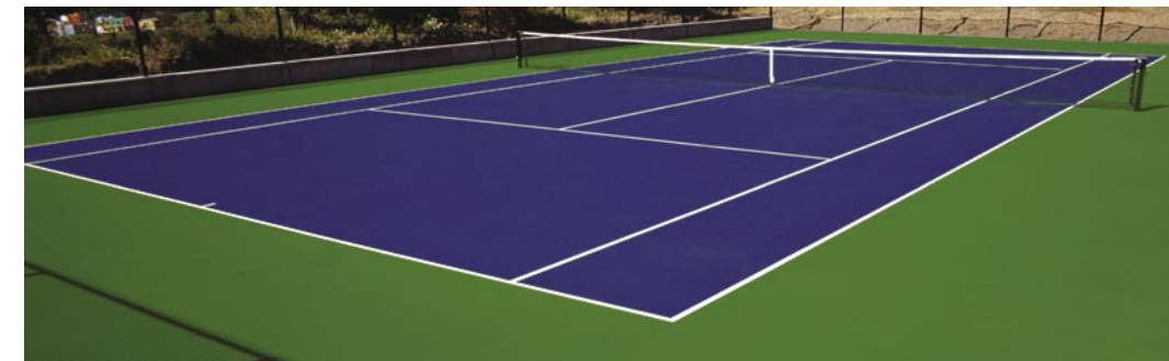
Light Green | Delta Blue