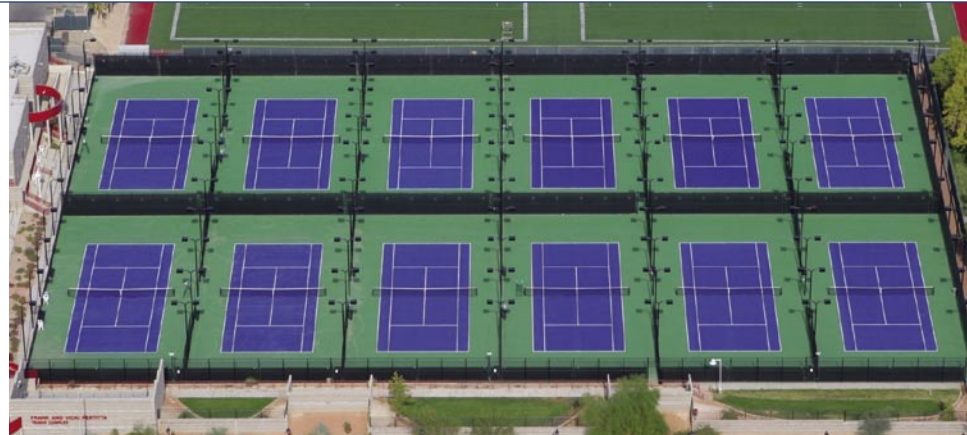
Distinguished Outdoor Tennis Facility for 2008 Fertita Tennis Complex, UNLV, Las Vegas, Nevada Awarded by the ASBA — 2008

World Class Athletic Surfaces are designed to provide the playability, durability and aesthetics to meet your highest performance requirements. World Class met those standards for the award-winning tennis courts at right.