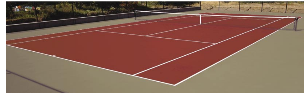
Sand | Brick