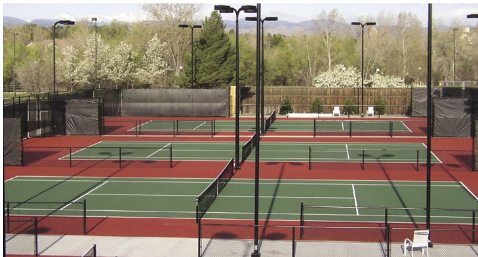
One of the Outstanding Facilities in the Nation Gates Tennis Center, Denver, CO Awarded by the USTA — 2008