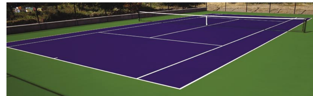
Light Green | Purple